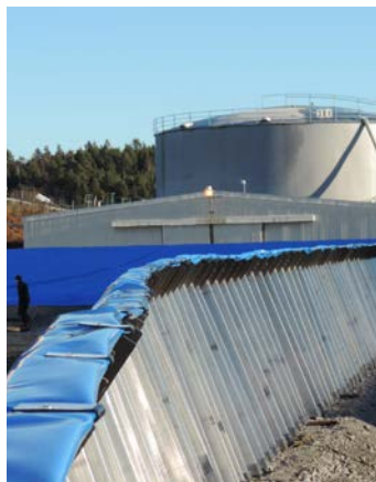
The double folded membrane is fixed with the clips. After clipping, fold down the edge and fix the membrane to the ground.