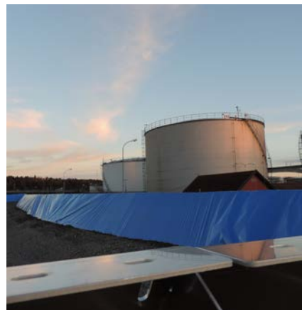
Photo shows the barrier H180 from the water side.