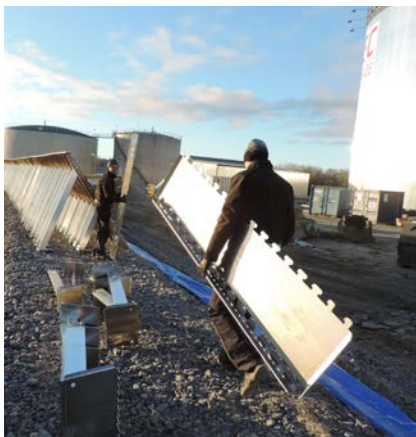
Photo showing installation of the H180 barrier. Simple to carry and handle, only 25 kg per section.